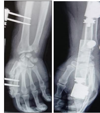
Fig 4a and 4b: Control radiograph of reduction osteosynthesis with external fixation.

All our patients underwent a minimum of 12 rehabilitation sessions before undergoing surgery. Treatment was surgical in all cases, without ligament suture. The indication for surgery was essentially based on the injury profile. The approach was dorsal in all cases. Two neglected RCDs were surgically reduced and immobilised with an external fixator (Figures 4a and 4b). The other 3 were also surgically reduced but fixed by screw and K-wire (n=1), screw plate (n=1) and simple K-wire (n=1). In the latter 3 cases, the wrist was immobilised in an anterior plaster cast. The severed extensor tendons were repaired in accordance with standard techniques. The criteria for successful surgical intervention were checked by fluoroscopy: reconstitution of the bistyloid line and radioulnar index, and absence of distal radioulnar translation.