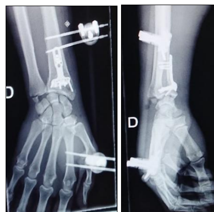
Fig 5a and 5b: Follow-up radiograph of a reduction - osteosynthesis using an external fixator - whose surgery was repeated with osteosynthesis using a screw plate.

In the postoperative time, patients were reviewed and re-examined in consultation at 4 weeks, 8 weeks, 12 weeks and then once a year.