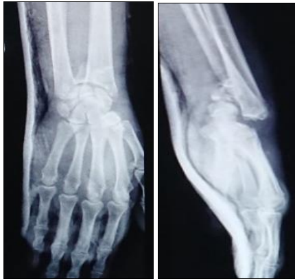
Fig 1a and 1b: Dislocation with fracture of anterior margin.