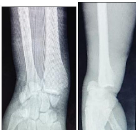
Fig 3a and 3b: Radiograph of posterior dislocation with radial styloid fracture.