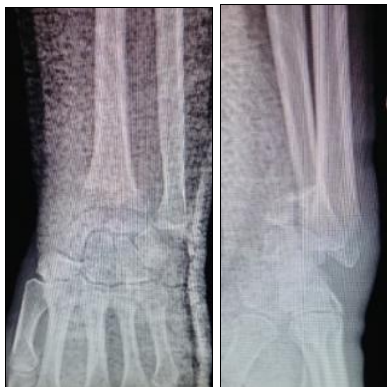
Fig 2a and 2b: Radiograph of an anterior dislocation with fracture of the anterior margin.