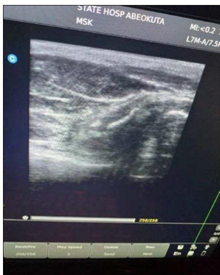
Fig 4b: Ultrasound scan of the left hand