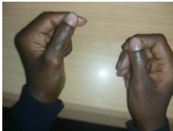
Fig 2: Dorsum of both Hands showing absence of Dorsal wrinkles on the thumbs