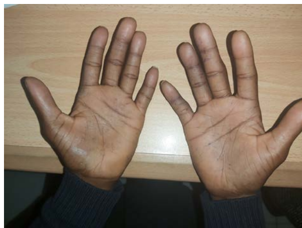
Fig 1: Palm of both Hands showing lack of flexor creases on the thumbs

MRI of the hands was not done as it was not available in the immediate environment of the facility.