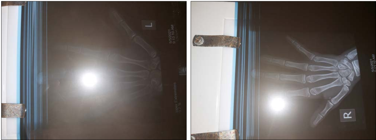
Fig 3a, 3b: Plain Radiographs of the hands showing normal skeletal pattern/ bony structure