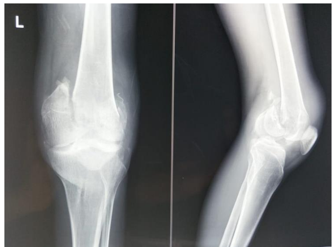
Fig 1: Antero-posterior and medio-lateral radiographs of Left knee joint showing Bicondylar Hoffa fracture.

at the level of the internal compartments of the knee. There was no neurovascular deficit or skin lesion. Because of the pain we had sought signs of laxity. The initial AP and lateral x-rays showed a bicondylar Coronal fracture (Figure 1). The CT scan showed Coronal fractures type Hoffa of the both condyles (Figure 2).