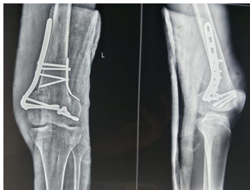
Fig 3: Post-operative radiograph of left knee in Antero-posterior and medio-lateral views with medial and lateral plate and cannulated cancellous screws in situ.